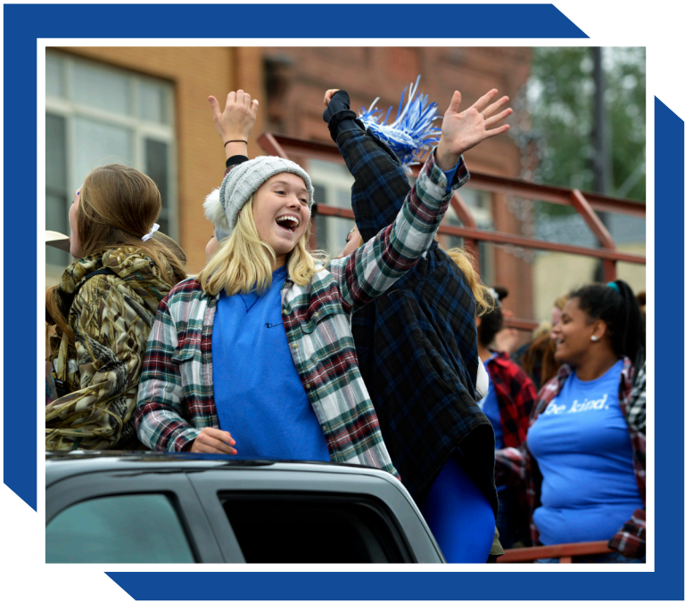
High schoolers wave from a float at the 2018 Homecoming Parade.

As the 2020-2021 school year approaches, the Minnewaska Area Schools Office of Community Education and Activities encourages everyone to participate in the wide variety of programming offered to those of all ages!